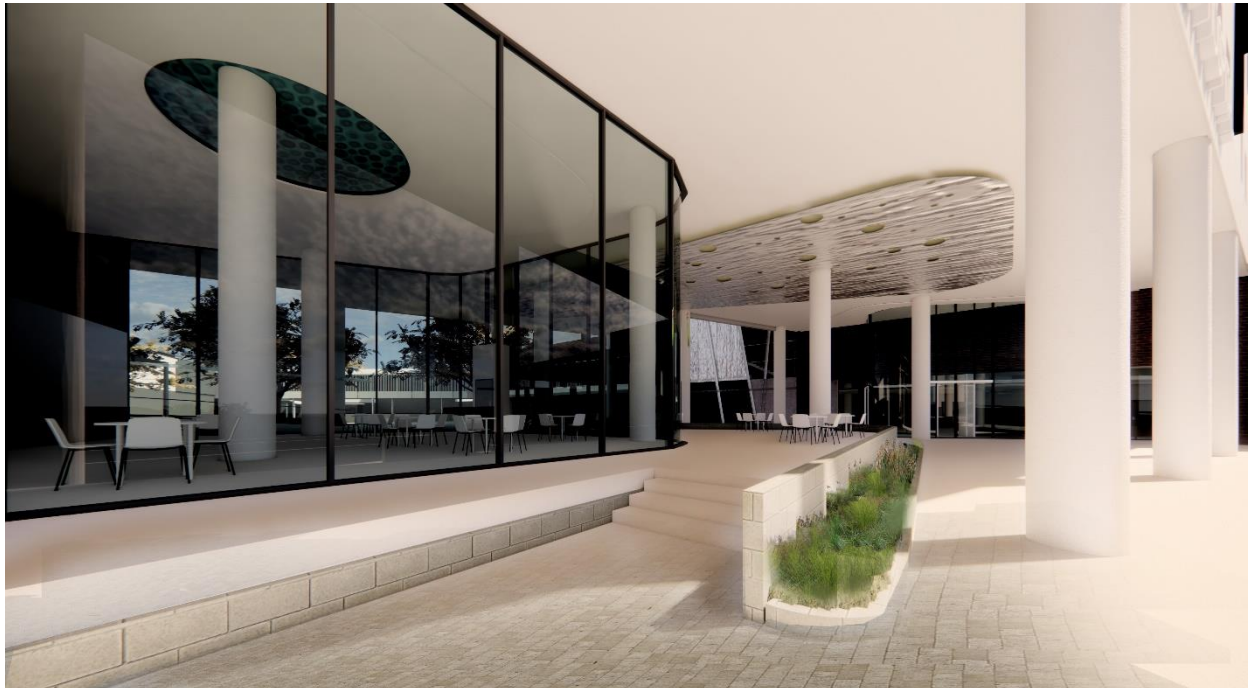
Artist impression of café near main entrance